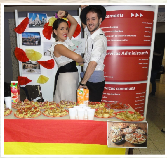
Erasmus students during the International Week